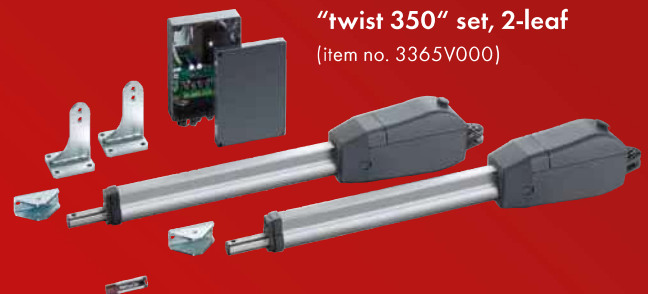
"twist 350" set, 2-leaf (item no. 3365V000)

incl. 1 swing gate operator, control board in housing, pluggable radio receiver (FM 868.8 MHz), post and gate wing bracket, 4-command transmitter (item no. 4020)