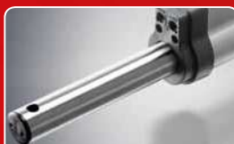
electronic limit switches with Reed contacts provide for a precise travel limitation

Last updated: 10/2013. Literal errors, errors and technical changes excepted.