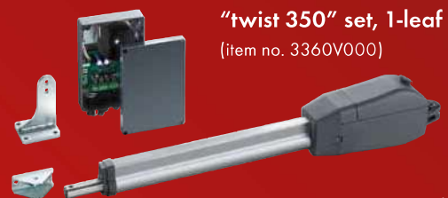
"twist 350" set, 1-leaf (item no. 3360V000)

incl. 1 swing gate operator, control board in housing, pluggable radio receiver (FM 868.8 MHz), post and gate wing bracket, 4-command transmitter (item no. 4020)