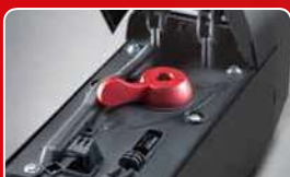
secure and convenient emergency release system